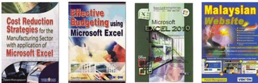
Sample books authored by Palani Murugappan